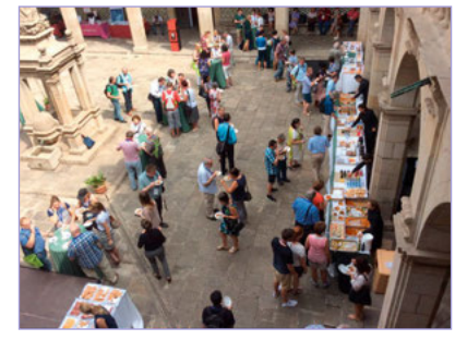
Figure 5. Lunch time at the cloister during ECRICE 2016.

Besides the enriching breaks for coffee and the times for lunch in the cloister of the venue building (figure 5), a variety of social events were organised for the attendees to help enjoy their time in Barcelona. Among the conference sessions, guided tours of the Casa de Convalescència, the venue for ECRICE 2016, and tours of the Royal Academy of Medicine of Catalonia were provided. A welcome reception was held of the iconic terrace of the MNAC (figure 6). The attendees enjoyed a reception from a privileged location: sweeping views across Barcelona up to the beautiful horizon of Collserola, where the church of Tibidabo had been especially illuminated. The famous musical