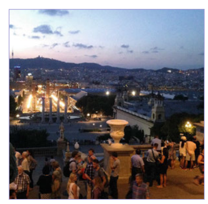
Figura 6. Welcome reception in the MNAC.

coloured water fountains of Montjuïc took the colours used in the ECRICE 2016 theme and a special playlist had been chosen. Attendees were able to take advantage of a private visit and tour of MNAC. The conference dinner took place at the Museu d'Història de Catalunya, with its privileged views across the old harbour. The final plenary session and closing ceremony was held in CosmoCaixa, the science museum (figure 7) nestled amongst the unique modernist villas located below Tibidabo. Guided tours of the museum and planetarium were available.