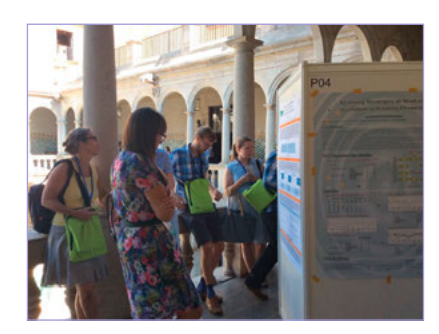
Figure 2. Participants discussing during a poster session

ing of chemistry. The outstanding scientific proposal was accompanied by events of a social and cultural nature: participants enjoyed a reception and guided tour of MNAC, CosmoCaixa and the Casa de la Convalescència, as well as the Royal Academy of Medicine of Catalonia.