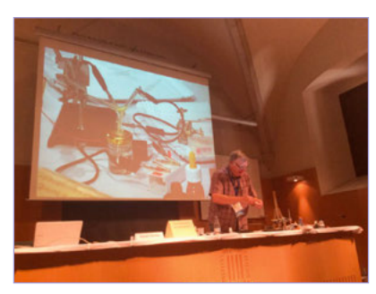
Figure 4. A chemical demonstration in room 2 (Sala Pere i Joan Coromines).

A total of 5 chemical demonstrations (figure 4) were given during ECRICE 2016 and included engaging topics such as «Nanotechnology experiments for general chemistry laboratory classes». David A. Katz utilises low-cost nanotechnology experiments, and related demonstrations using nanoparticles, cholesteryl liquid crystals and aqueous ferrofluid. These hands-on experiments along with discussions about the application of these experiments give students an understanding of nanotechnology. The chemical demonstration «React... explode! From alchemists to catalysts